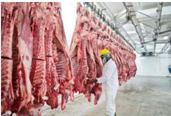
Processing & Packing (fruit, vegetables, chicken, eggs, pork, beef, lamb or other livestock)

CIRCLE all that apply below, even if the work was only for a short period of time.