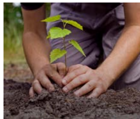
Forestry (soil preparation, planting, growing, cutting trees)