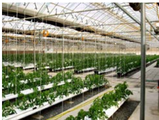
Nursery or Greenhouse (planting, potting, pruning, watering, harvesting)